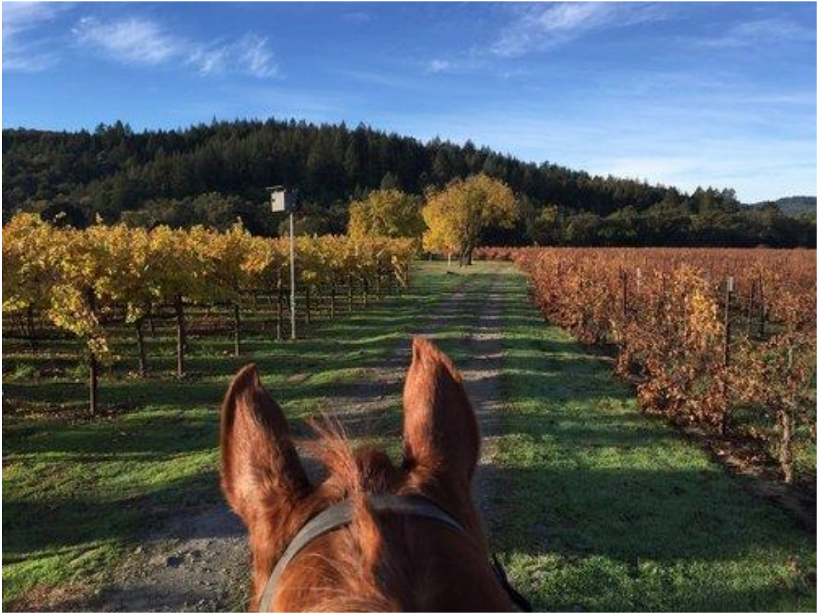
PRIVATE GUIDED TOURS / SPECIAL EXPERIENCES